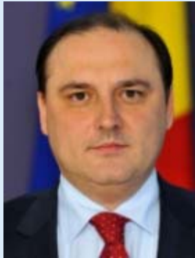
Alexandru-Răzvan Cotovelea Minister of Communication and Information Society