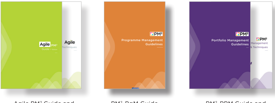
Agile PM<sup>2</sup> Guide and Agile Tools & Techniques