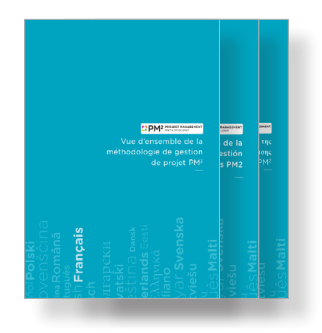
PM<sup>2</sup> Overview (available in 23 languages)